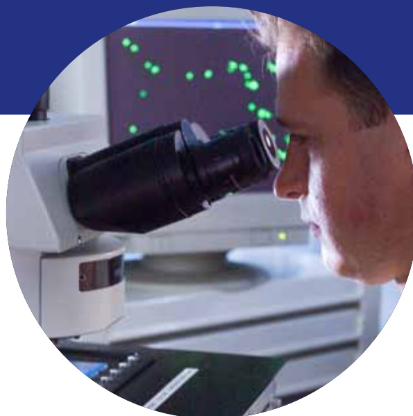
FISH microscope

In the beginning, there was Danone, already inherently permeated by the values of nutrition and health. In 1991, Danone decided to promote public health by developing and spreading knowledge about nutrition, diet and health, and set up its first Institute. Twenty years later, there are now 17 Danone Institutes worldwide, operating under the aegis of the Danone Institute International. The latter has been awarding the Danone International Prize for Nutrition every two years since 1997 to a research scientist or research team conducting noteworthy studies in human nutrition. Today, this prize is one of the Institute's key activities but also highlights Danone's long-standing commitment to nutrition and health.